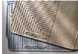
All Weather Mats $99.00 Parts Only MSRP**