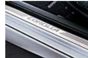
Door Sill Enhancements $159.00 Installed MSRP*