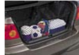
Cargo Net $49.00 Installed MSRP*