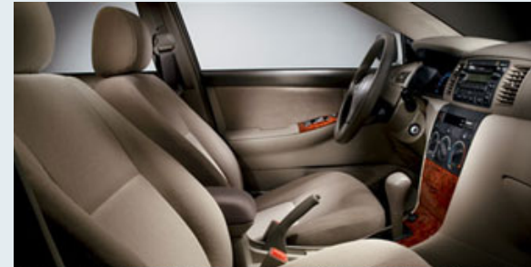
LE interior shown in Pebble Beige with available JBL® Value Package