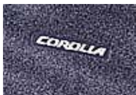
Cargo Mat $81.00 Installed MSRP*