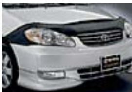
Front End Mask $88.00 Parts Only MSRP**