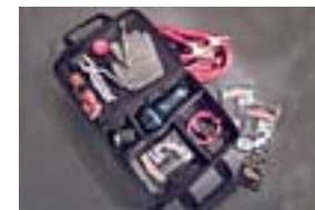
Emergency Assistance Kit $70.00 Installed MSRP*