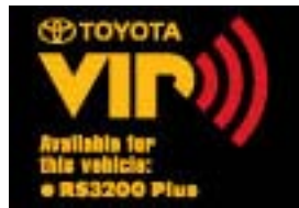
VIP Security System RS3200 Plus $359.00 Installed MSRP*