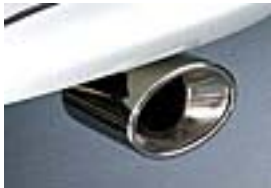
Exhaust Tip by Valor Manufacturing $64.00 Installed MSRP*