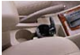
Ashtray Cup $18.00 Parts Only MSRP**