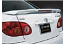
Rear Spoiler $425.00 Installed MSRP*