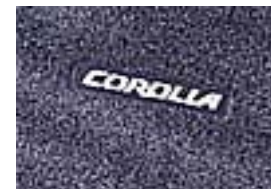
Carpet Floor Mats (4pc. set) $90.00 Installed MSRP*