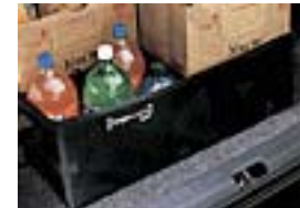
Cargo Tote $40.00 Installed MSRP*