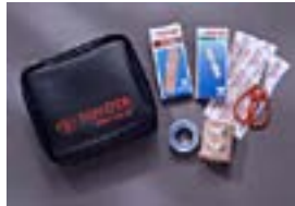
First Aid Kit $29.00 Installed MSRP*