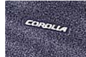
Carpet Floor Mats/ Cargo Mat Set (5pc. set) $171.00 Installed MSRP*