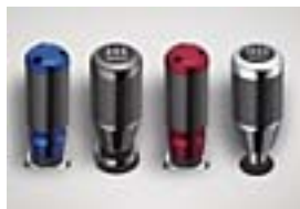
Shifter Knobs by OBX Racing Chrome or Titanium $49.00 Installed MSRP* Blue or Red $42.00 Parts Only MSRP**