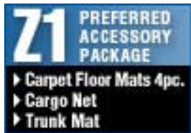
Preferred Accessory Package $220.00 Installed MSRP*