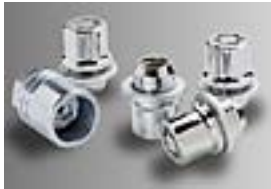
Alloy Wheel Locks $65.00 Installed MSRP*